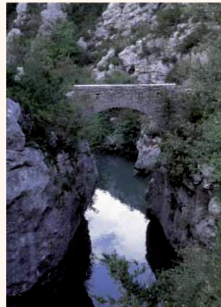
Comps . Photo : Marc DOUSSIÈRE

Moustiers-Sainte-Marie, at the grand canyons entrance, near the Sainte-Croix Lake is renowned for its faïence. In the heart of the famous gorges, La Palud-sur-Verdon and Aiguines are a rock climber's paradise. In Valensole, the rows of lavender on the plateau fill the summer air with a sweet perfume. Riez, the oldest Gallo-Roman city, has a colonnade from a tetra style temple (1st century) and a Paleo-Christian baptistery (5th century). On the left bank of the Verdon, the villages of la Verdière, Trigance and Bargème, grouped under their medieval châteaux paint a scene of homes huddled together under a canopy of tile roofs.