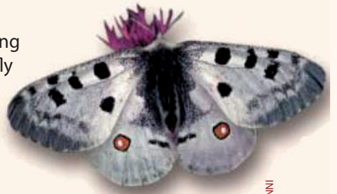
Parnassius Apollo . Photo : Alain GIOANNI

Restore the heritage, study the fauna and flora, protect sensitive sites, develop welcoming and information centres like the 'Maison du Parc' (Bastide de Valx) opened last January, develop cultural centres and activities, manage the classified sites of the Gorges du Verdon... these are among the many actions led by the Verdon Regional Natural Park.